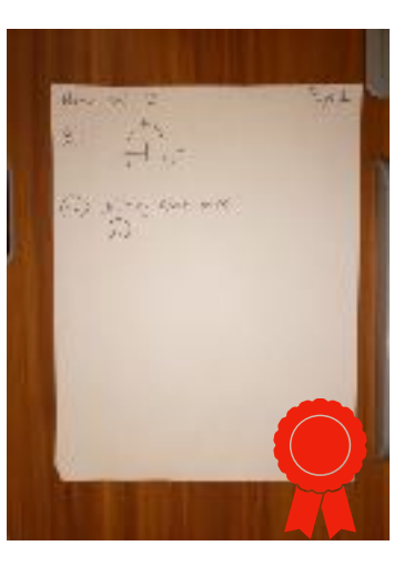
GOOD POSITION, WRITING IS LEGIBLE, SINGLE PAGE IN FRAME